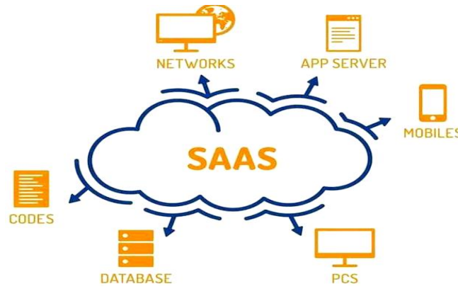
Fig. 1: saas products

Cloud computing has four different deployment modes as mentioned in figure 2. Those modes are: